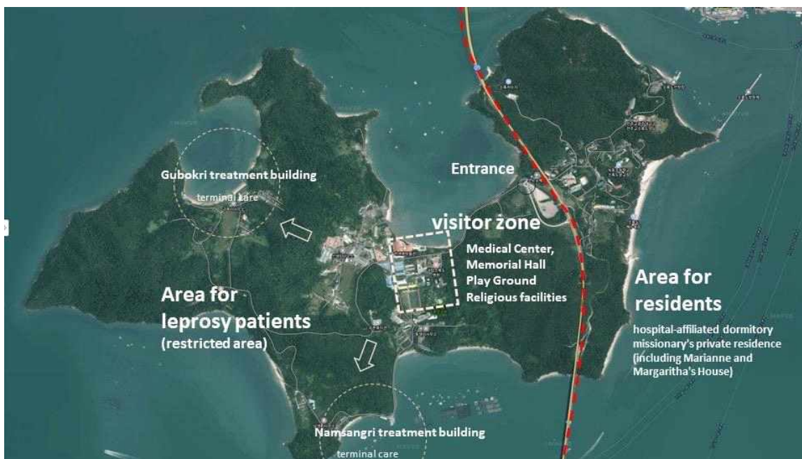
Area separation in Sorok island