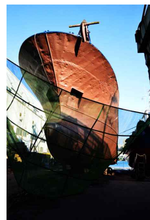
Ships being repaired /re-painted at the shipyard

Another relatively less known spot in Yeongdo is the pathway along the shipbuilding yards in Namhang-dong. This is where the ship repair centers are located. Here visitors can watch how ships are maintained, repaired and re-painted, scenes that are rare to find in big cities. Many shipyards, some more than a century old, are still operating. The unfamiliar stinging smell of oil and steel somehow compels you to lift your camera to your eyes in awe. The Busan Tourism Organization (BTO) plans to turn this pathway into a tourist destination. Already several foreign broadcasting stations have visited, according to a BTO official, and apparently loved it.