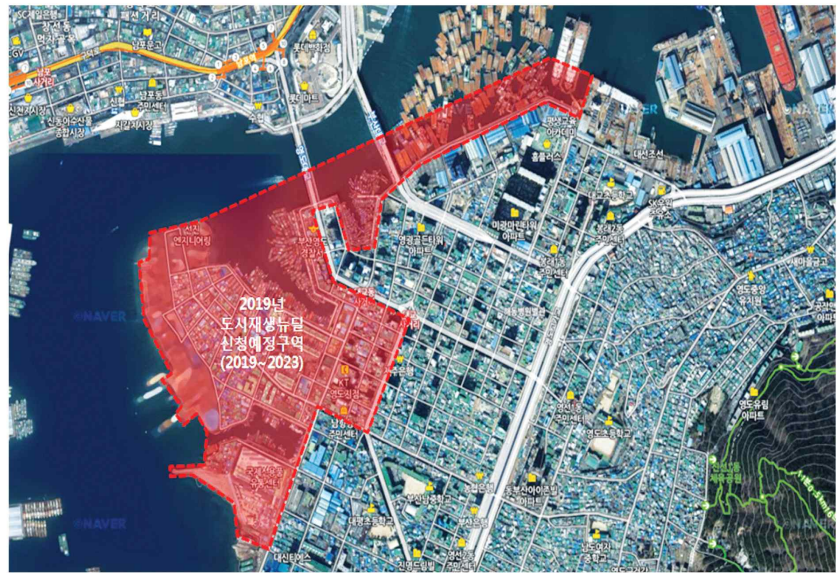
Target place for the 2019 urban regeneration base plan

The creation of base plan will be commissioned in the second-half of this year and completed in the first-