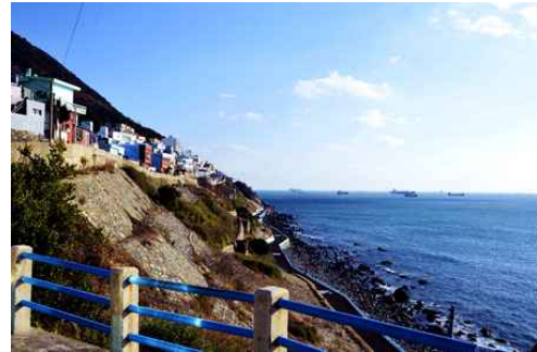
Hinyeoul Munhwa Maeul

One of the most beautiful scenes in Yeongdo is viewed from the coastal walkway called the "Jeoryeong Haean Sancheongno." It's a 3 kilometer-long promenade that begins at a village called "Hinyeoul Munhwa Maeul (흰여울문화마을)" which translates as "white rapids cultural village." It was named so because of how the rapidly-flowing water from Mt. Bonglae(봉래산) appears from a distance. The village, located on a hill in Youngsun-dong, used to be a shantytown but was turned into a cultural village in 2011 by the city government to turn it into a visitor-friendly place. Since then, houses have been painted in various colors with murals on their walls. Artists and sculptors opened up workshops and studios at the village, turning the whole location into an artistic town. Although the village is still occupied by its original low-income residents, it's popular among tourists and photographers who crave beautiful shots. It now even has a catchy nickname: "Korea's Santorini." The Hinyeoul-gil, the coastal pathway along the village, also became a popular filming location in the past few years.