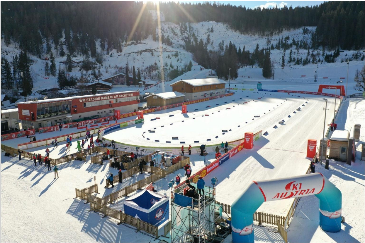
Existing Nordic disciplines stadium and media facilities in Ramsau