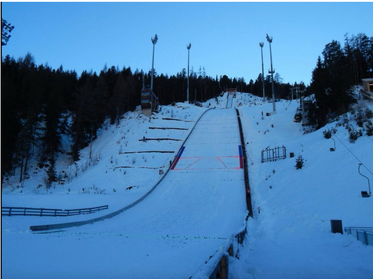
The ski jump on Kulmburg