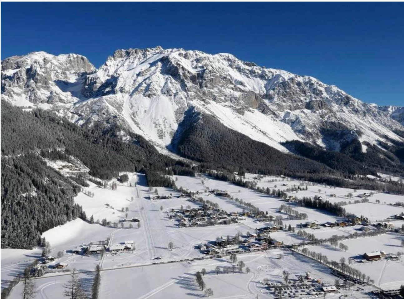
Dachstein panorama, a view from Kulmberg