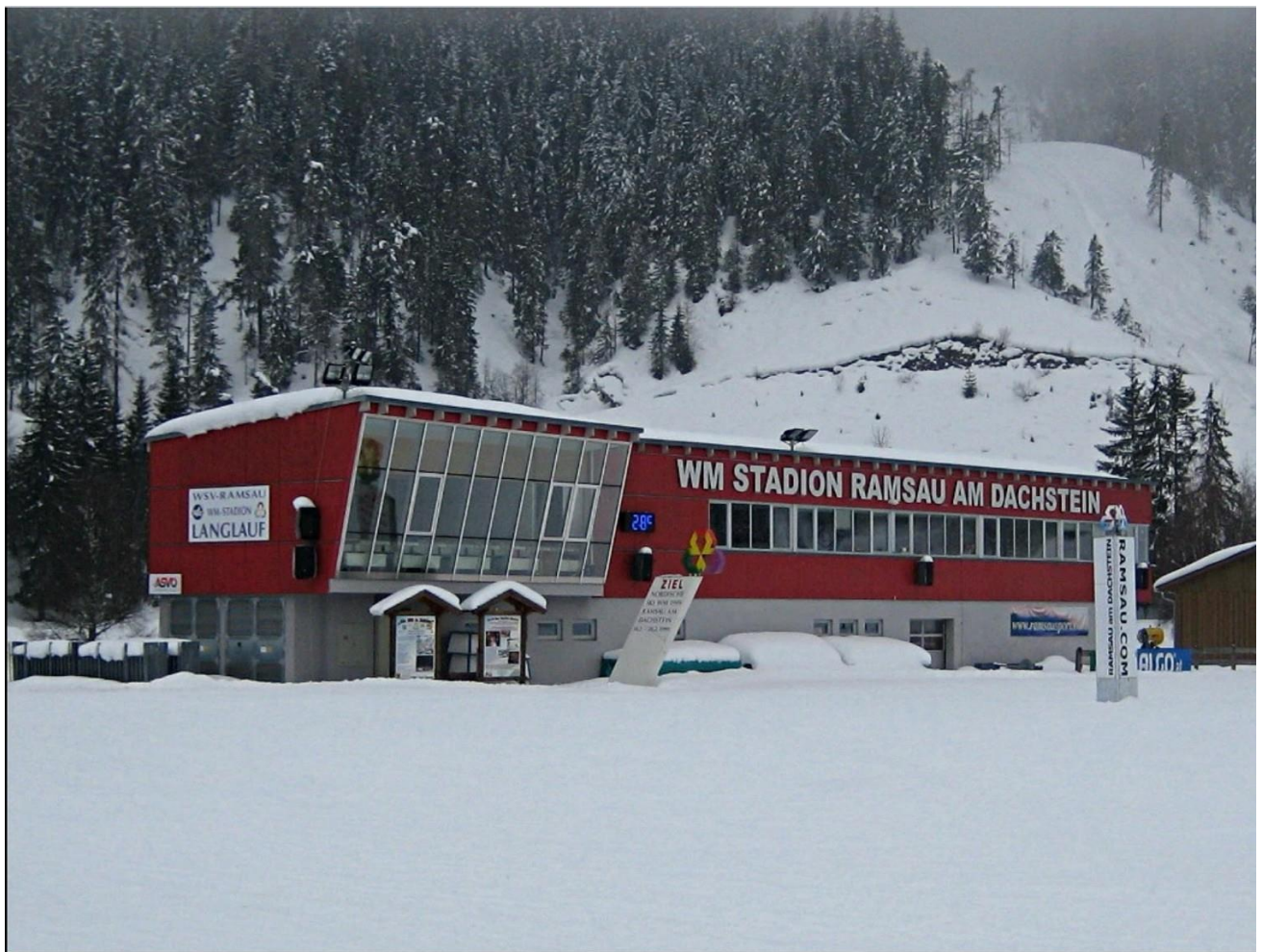
The stadium main facilities, Eurolopet cross-country run

The World Championship is to be held from 19 February to 2 March 2031. But the Schladming-Dachstein region should also be recognized as a promising training and sports center. Meanwhile, the existing sports infrastructure has served sports-loving audiences for more than 25 years. It has to be revamped for the next Nordic World Championship and remain in excellent condition for the next 25 years. Even in 2050, Ramsau am Dachstein should be the Austrian home for all generations in all seasons and all Nordic disciplines. Below, the respective infrastructure areas are examined in more detail, and future investments are specified.